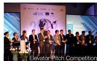
Elevator Pitch Competition