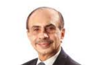
Adi Godrej Chairman of Godrej Group