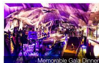
Memorable Gala Dinner