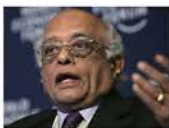
Rajagopala Chidambaram Principal Scientific Advisor to Govt of India