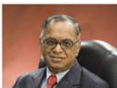
Narayan Murthy Founder of Infosys